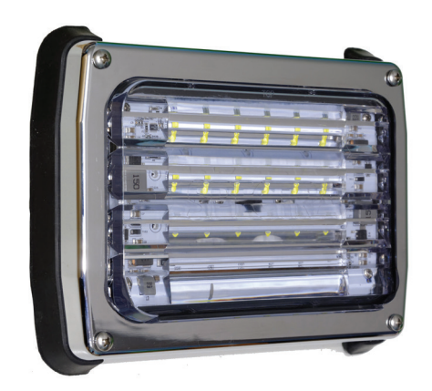
SPA950 Surface Mount Light

Connect the RED wire to POWER Connect the BLACK wire to GROUND.